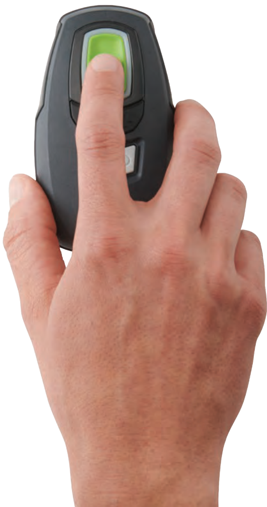
Inspire Sleep Remote

Inspire works inside your body while you sleep. It's a small device placed during a same-day, outpatient procedure. When you're ready for bed, simply click the remote to turn Inspire on. While you sleep, Inspire opens your airway, allowing you to breathe normally and sleep peacefully.